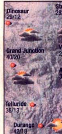
Shown is today's forecast. Tr